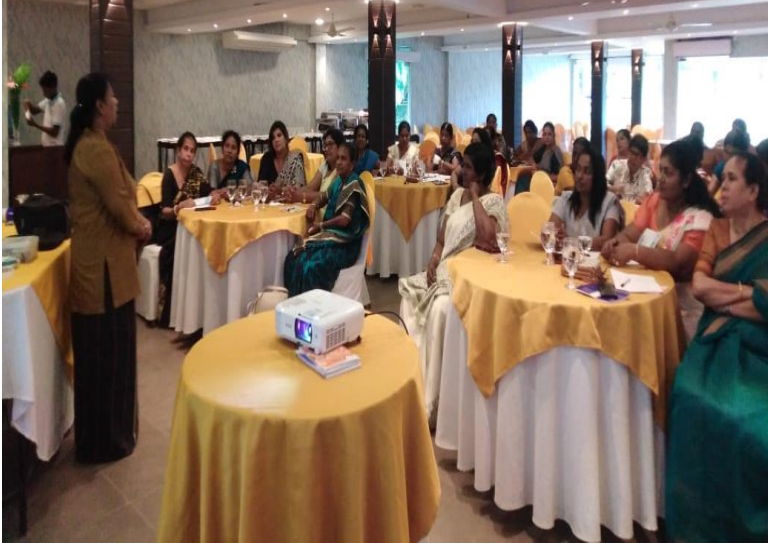
Provincial-level workshops with women political leaders