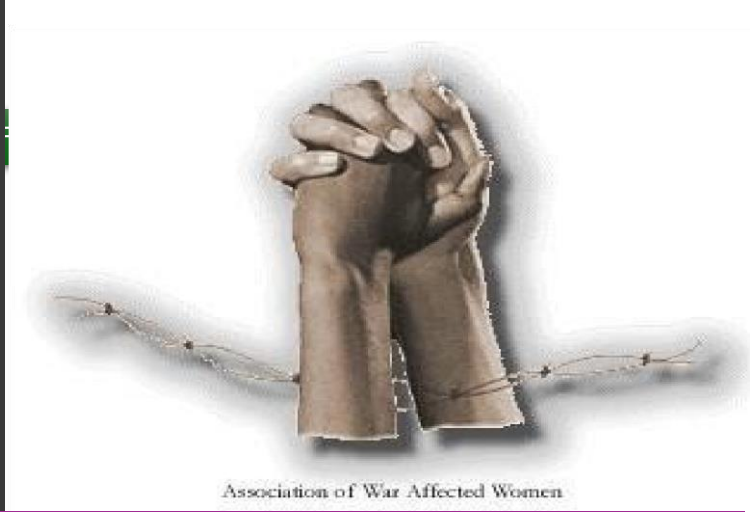
Association of War Affected Women