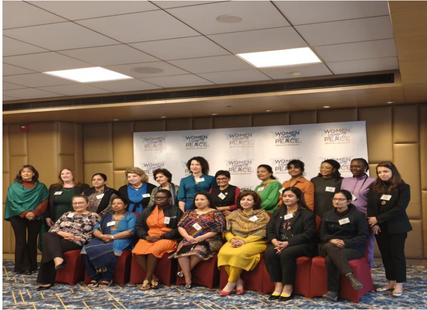
GPPAC RSG in Kathmandu, Nepal