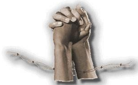
Association of War Affected Women

Special thanks to our donors, for their generosity without which we would not have been able to continue our journey thus far