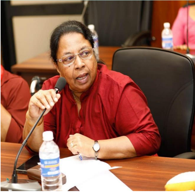
At the review meeting of the implementation of National Action Plan on UNSCR 1325 of Sri Lanka