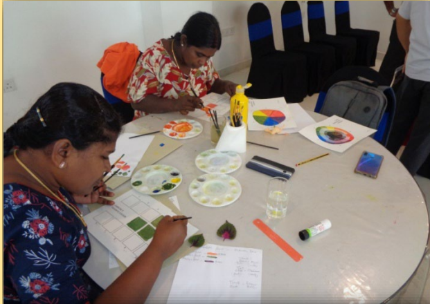
Training sessions to enhance basket weaving skills of women of Mannar