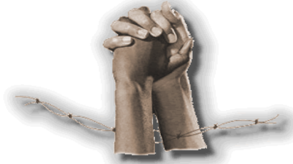
Association of War Affected Women