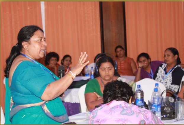
Women's Space in the Political Arena: Proposals from the Parliamentary Caucus